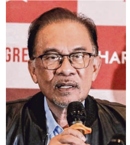
Datuk Seri Anwar Ibrahim is backed by 82 lawmakers from his Pakatan Harapan coalition and his electoral ally Muda.

was not raised at all during formal or informal meetings.” PH chief secretary Saifuddin Natusion Ismail also alleged that Datuk Seri Hamzah's claim of obtaining a simple majority was “premature, impossible and inconclusive”, as BN MPs had yet to commit to any prime ministerial candidate. But as at Monday evening, Umno was deeply divided. Some leaders had called on Zahid, who wants to commit BN's 30 MPs to support PH, to resign, and said they preferred to support PN. However, Zahid insisted that any written pledge of support for any prime ministerial candidate prior