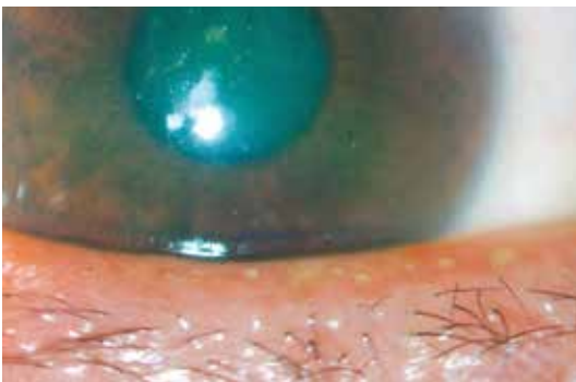
Inflamed eyelid margin with blocked meibomian glands.