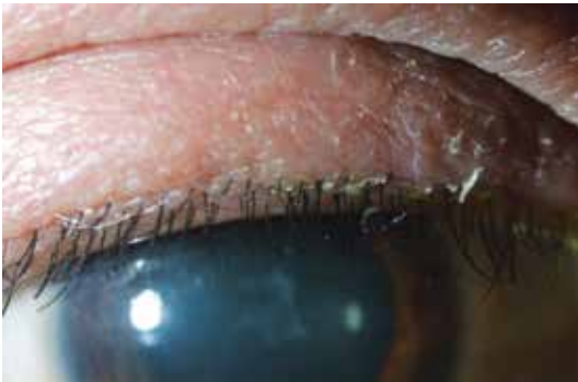
Debris and crustings of eyelashes.